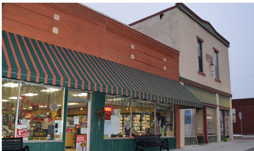
Garden of Eden on Main Street in Little River, Kansas.