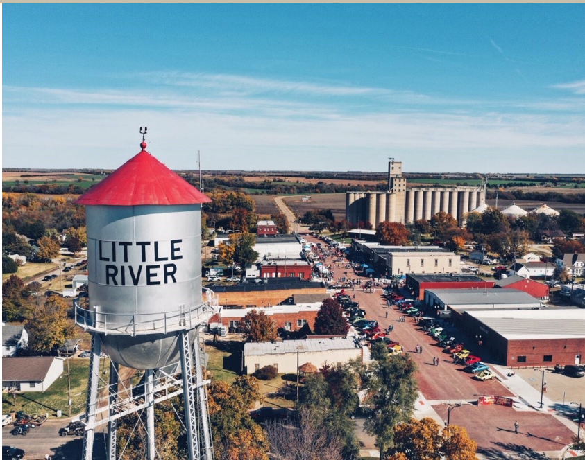
Downtown Little River, Kansas from above.