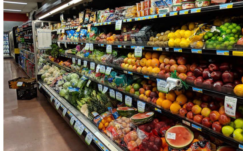
The produce section in Hired Man's Grocery & Grill, Inc.

This region of Kansas has a rich agricultural heritage. Sumner County is sometimes referred to as the "Wheat Capital of the World." Much of the land surrounding Conway Springs is farmed in wheat. Otherwise, residents are likely to commute 30 miles into Wichita for work.