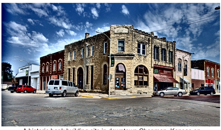
A historic bank building sits in downtown Chapman, Kansas on a sunny day in 2014.