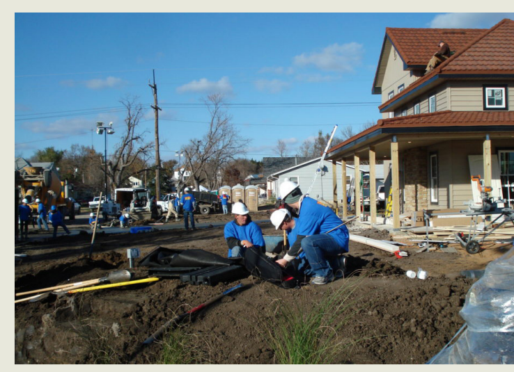
Above left, Chapman residents hug while examining the wreckage from the 2008 tornado. Above right, local volunteers work together during the filming of Extreme Makeover: Home Edition.